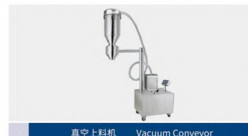
真空上料机 Vacuum Conveyor