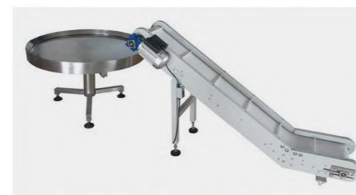
成品输送机&成品转盘 Finished Product Conveyor Turn Table