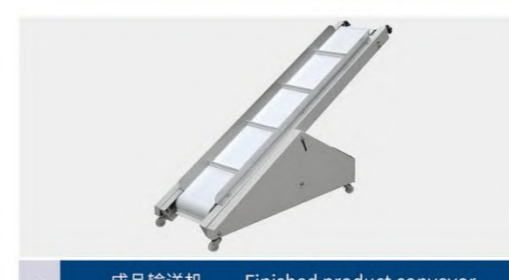
成品输送机 Finished product conveyor