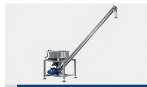
螺杆提升机 Screw auger conveyor

Suitable to deliver sheet, massive material etc. Such as food, feed and chemical industry. Conveyor to work through the chain of transmission with large lifting quantity and high lifting height.