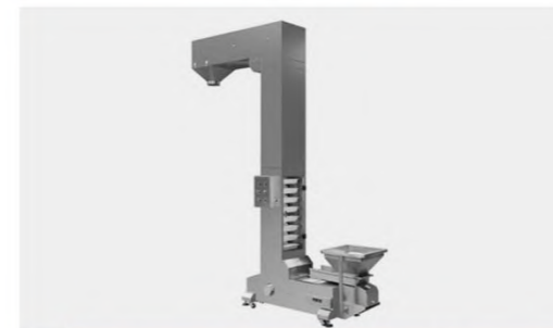
Z型物料输送机 Z-Type Bucket Elevator